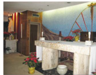
Lourdes Center Chapel, Boston