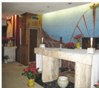
Lourdes Center Chapel, Boston